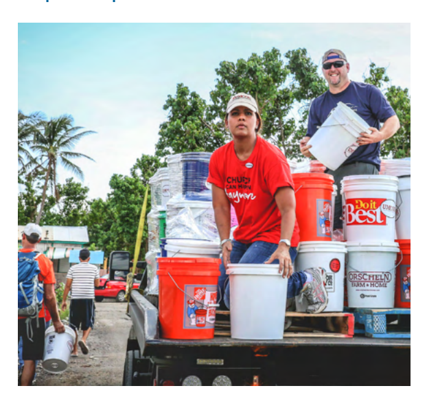
Following the wreckage of 2017's Hurricane Maria, workers with Global Ministries and UMCOR assist with clean-up efforts in partnership with the Methodist Church of Puerto Rico.

Global Ministries of The United Methodist Church aspires to be the partner of choice for conferences, congregations and others worldwide who wish to participate in God's mission.