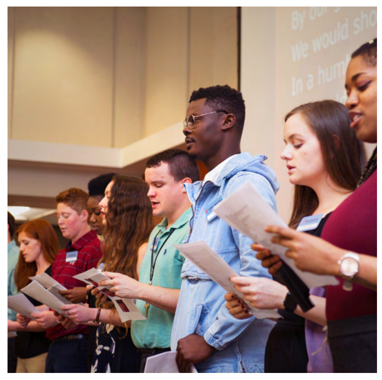
During a 2018 visit to Global Ministries' offices in Atlanta, Georgia, Global Mission Fellows share their experiences of serving as US-2 track missionaries.

s the 17 missional programs described above respond to and work in accord with the agency's updated Strategic Plan, it is important to keep in mind that they depend on their respective program units. These units are, namely, Missionary Service, Global Mission Connections, Multiethnic Ministries, Global Health and UMCOR, as well as a range of supportive administrative and operational ministries, listed below, each of which aids effective and efficient mission